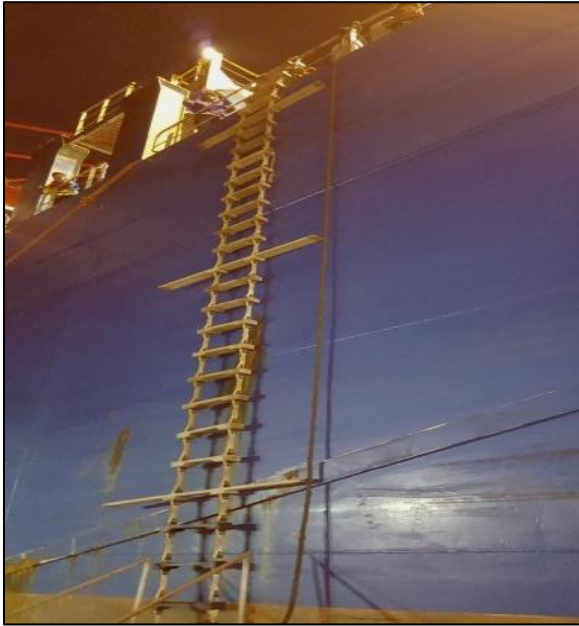
Figure 2: The pilot ladder, down to the bunker supply barge

the third engineer, a fitter and two engine ratings assembled at the bunker station on the main deck.