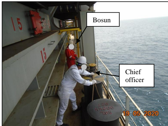
Figure 2: A photo simulation of the bosun holding on to the pick-up gear and the chief officer clearing the eye of the tug's line from the mooring bitts

ordered the forward party to cast off the forward tug's line. Upon arriving near Bay 15, the bosun cleared the pick-up gear of the tug's line and made turns of it around the nearby capstan, to release the tug's line from the vessel's mooring bitts. Once tension was taken on the capstan, the chief officer cleared the tug line's eye from the mooring bitts (Figure 2).