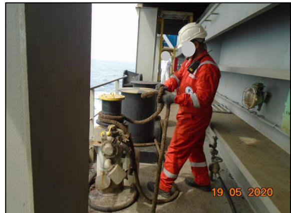
Figure 4: A photo simulation of the bosun attempting to disconnect the messenger line and the pick-up gear

At 2118, the eye of the tug's line reached the waterline, and the chief officer reported to the bridge that the forward tug was cast off. At this time, while the pick-up gear was still moving under tension, the bosun noticed that the vessel's messenger line was still attached to the pick-up gear by a knot. While he attempted to disconnect these ropes 6 (Figure 4), his left leg was caught between the pick-up gear and the mooring bitts (Figure 5).