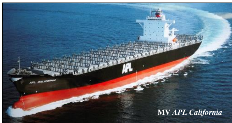
MV APL California

The MSIU has issued one recommendation to the Company to address the vessel's manning in exceptional circumstances.