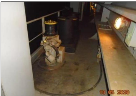
Figure 6: Accident site illuminated at night-time

Additionally, since the operation was being carried out during night-time, the crew had to rely on the fixed illumination fitted on deck, which emitted a yellow light (Figure 6).