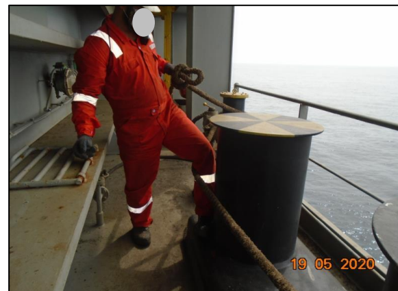
Figure 5: A photo simulation of the bosun's left leg getting caught in between the pick-up gear and the mooring bitts