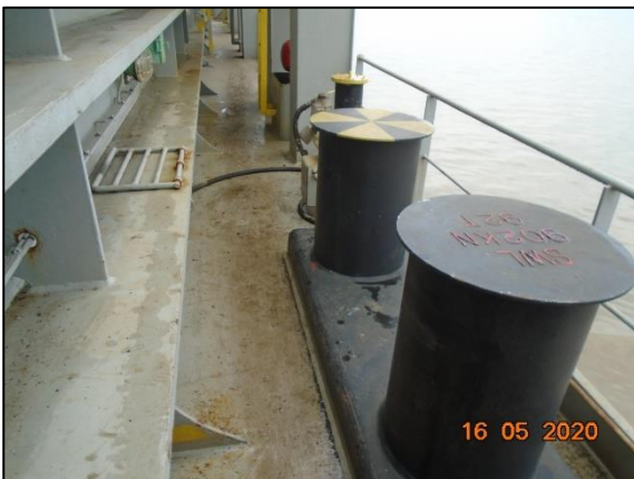
Figure 1: Mooring bitts where the tug's line was made fast for departure

Fixed artificial lighting illuminated the site.